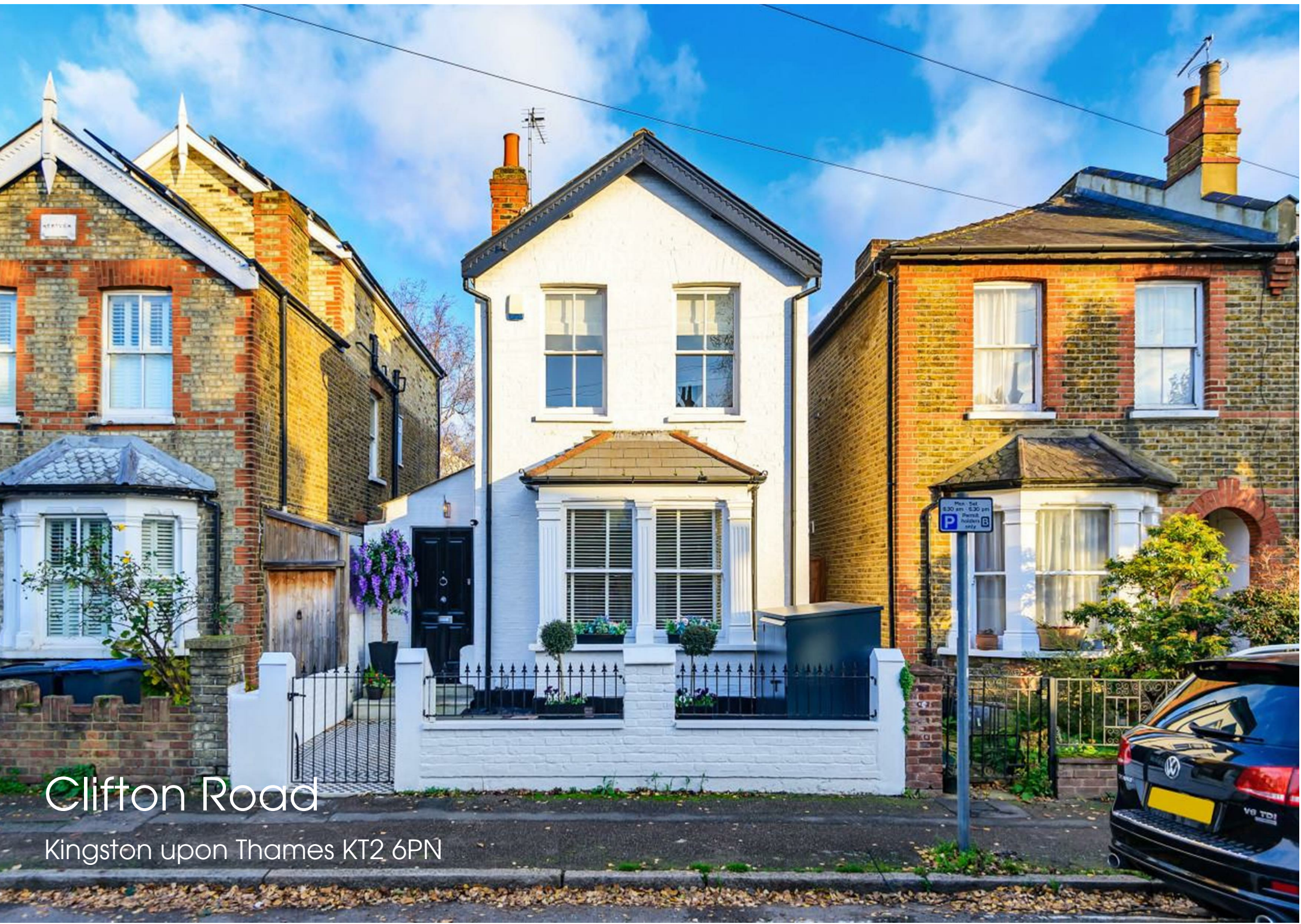
Clifton Road Kingston upon Thames KT2 6PN